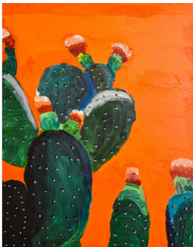
Town of El Paso