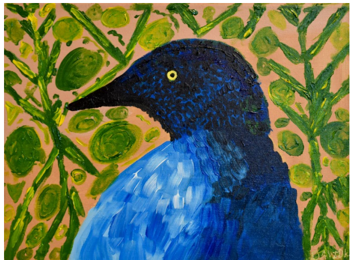
Grackle in the Jungle