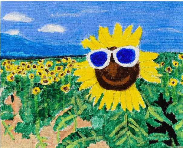
Groovy Sunflower - Haji A.