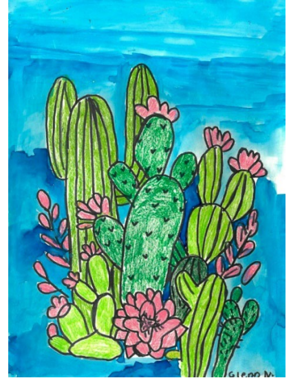
Summer Succulents - Glenn N.