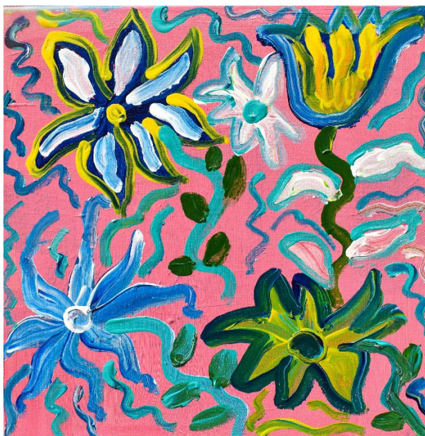
Spring Flowers – Holly R.