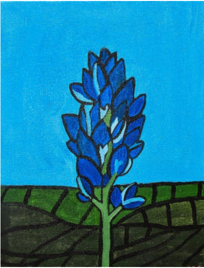
Bluebonnet Growing Up - Raquel R.